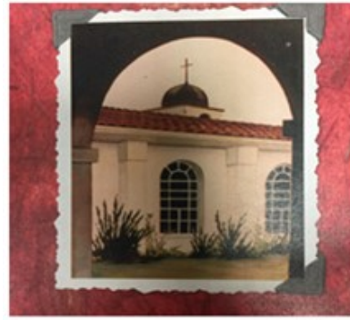
Imagen perdida el ano pasado al volver del festival a la Iglesia. Si la han visto favor de comunicarse con la oficina @ 979 -233-5271.

Por favor de entregar el dinero de los boletos de la rifa lo mas pronto posible. Gracias por todo lo que hacen por su parroquia